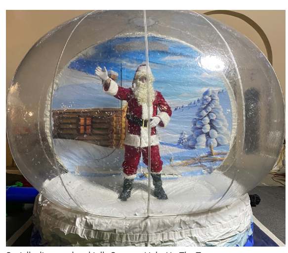
Socially distanced and jolly Santa at Light Up The Town