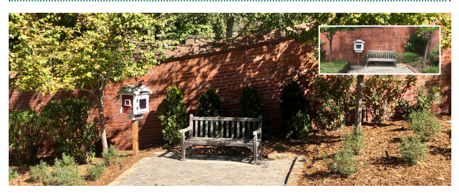
Jackling and Bailyanna site (before photo inset)

Now the answer to "Is Hillsborough Beautiful?" is YES. It's your community. Your generosity makes our work possible.