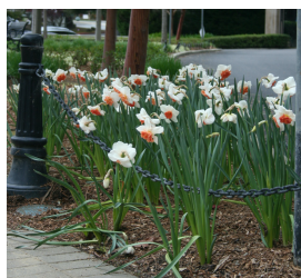
Daffodils at New Place Island