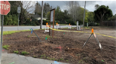
Floribunda Avenue at Walnut Avenue